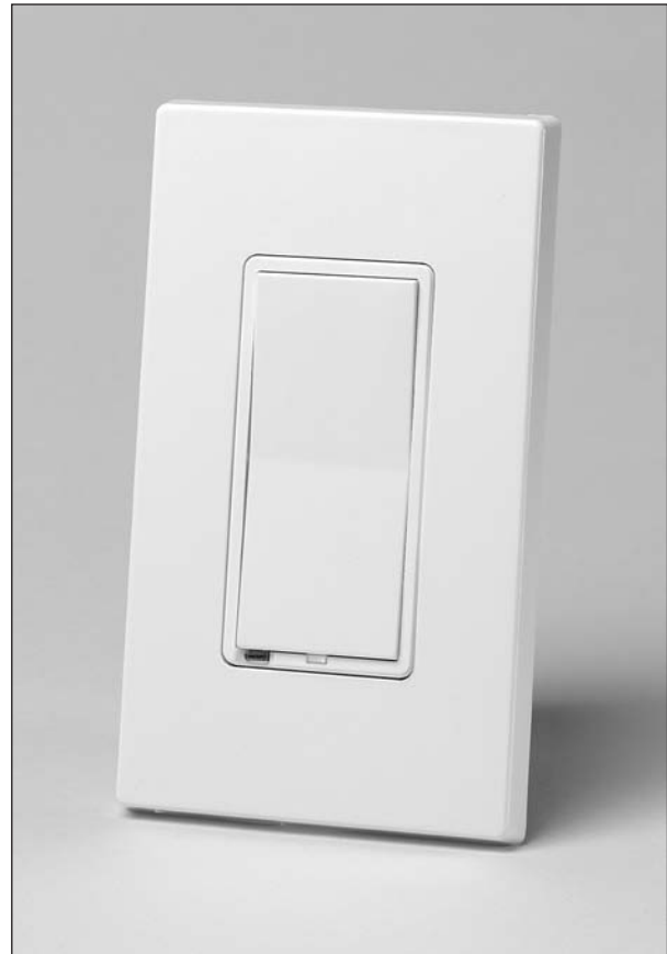
Cat. No. HCM10-1SW