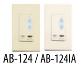
AB-124 / AB-124IA