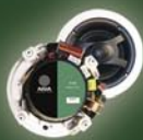
ARIA™ Multi-Room Audio